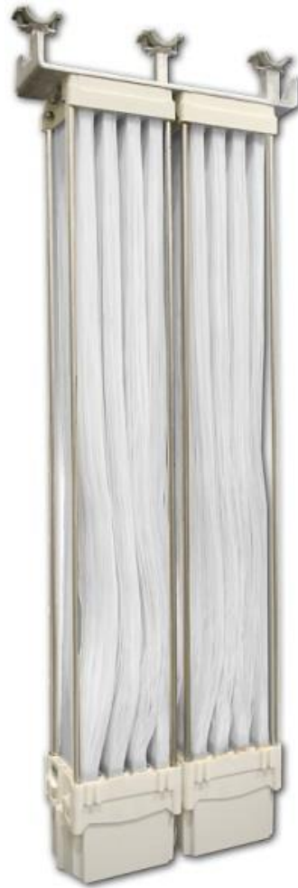
Figure 2: ZeeBlok 500S-A Immersed Ultrafiltration (UF)